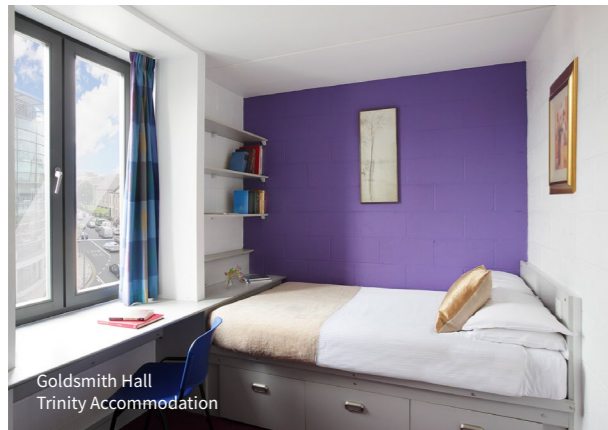
Goldsmith Hall Trinity Accommodation