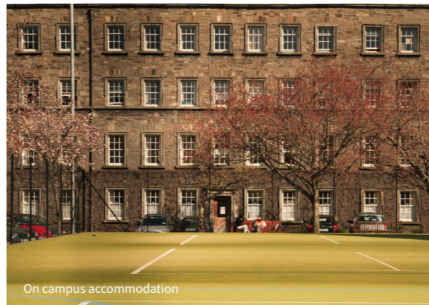
On campus accommodation