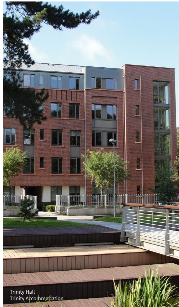
Trinity Hall Trinity Accommodation